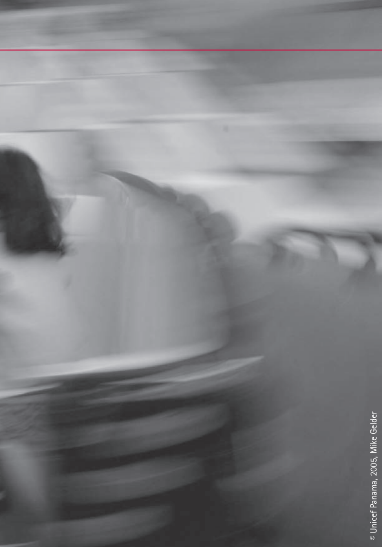
© Unicef Panama, 2005, Mike Gelder

threat to society” may be abused by the police. Children and adolescents, especially girls, may also be subjected to psychological violence and sexual abuse in the different environments where they grow up (Pinheiro, 2006).